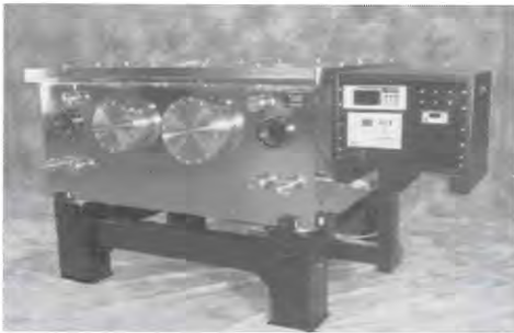
GPR, Inc.'s semiconductor chamber.

That was the beginning of GPR, Inc., located in Fairfield, N.J. Today, the company — celebrating 25 years in business — employs 45 people and creates and ships to semiconductor equipment manufacturers not only throughout North America, but from around the world, including those in Japan and China.